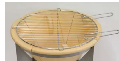
Grill chromed and with fold-down handles FSS-GR | Ø 48 cm | 1 kg