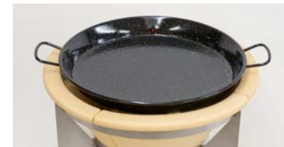
Enamelled frying pan FSS-BP | Ø 46 cm | H 5 cm | 2 kg

Our enamelled steel pan or our large grill can be used to produce wonderfully tasty vegetables, fish, meat or paella. The brazier turns grilling and roasting into child's play: Allow the wood to burn down – depending on the desired heat – place the pan or grill in position. Any fat dripping onto the ceramic automatically burns away.